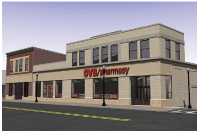
An artist's rendition of what a new CVS would look like is plans progress to revitalize a portion of Upham's Corner.